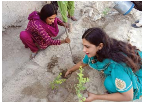
Plantation of tree saplings, Muzaffargarh