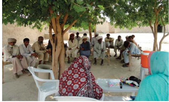
Awareness session with males