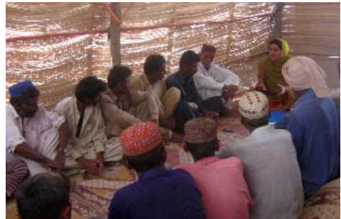
Awareness session with males