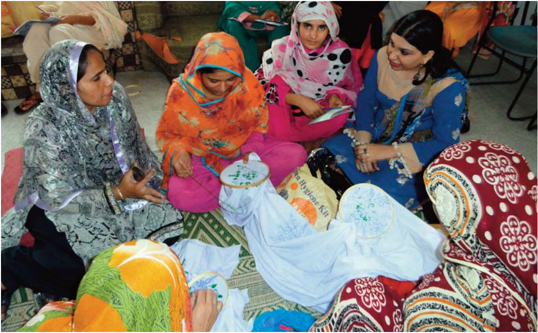
Members of SG & SYCOP share a light moment with women at the Dar ul Aman

complained of a complete absence of medical institutions such as hospitals, clinics or dispensaries, which compelled them to travel to Muzaffargarh city whenever they needed medical attention. Since this was difficult for most women, their health issues were generally neglected and the expense of travel was only borne when it became absolutely necessary. Such challenges to women's mobility meant that childbirth was frequently performed at home and travel undertaken only when complications arose.