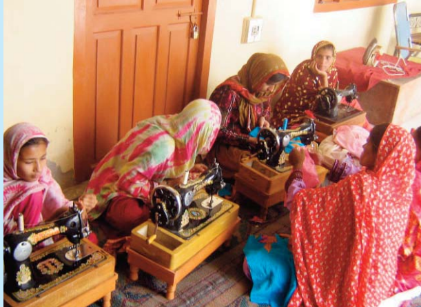
Sewing lessons begin