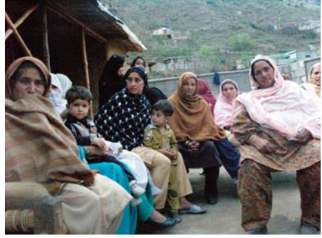
Rapid Needs Assessment and Focus Group Discussion

Marghazar that are not given adequate attention. He points out that there is a dearth of health facilities for women and that even LHVs and dispensaries are few and far between. He also feels that education is not given due importance. “The residents of the area have failed to recognize that children should not be wasting time and that education can improve their future prospects,” he says elaborating, “At best children here study till the 8th or 10th grade and then leave. The situation for females is far worse.”