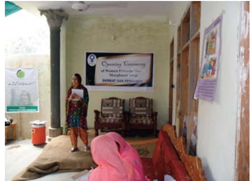
Inauguration ceremony of the WFS

For effective intervention, it was imperative that Shirkat Gah's facilitator was integrated into the community. The focal point for this area, a Shirkat Gah staff member was the first to conduct a session with males. When the focal point approached the men for a meeting she was informed that community members did not approve of a female talking to males. Thereafter all sessions were conducted via a male member from a partnering Community Based Organization (CBO). This was a break from the usual manner in which such sessions were conducted in the flood affected areas of other provinces.