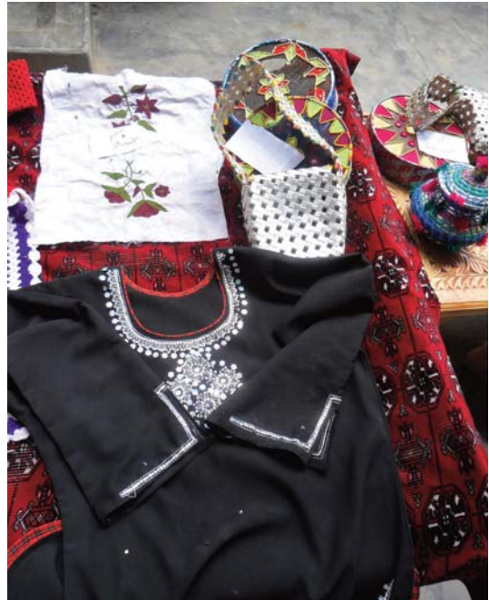
Handicrafts made by women at the WFS