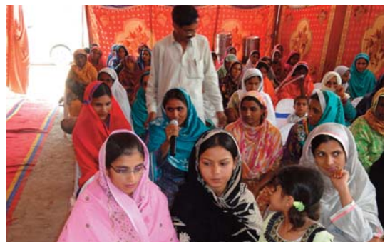
Women participating in a discussion at the inauguration ceremony