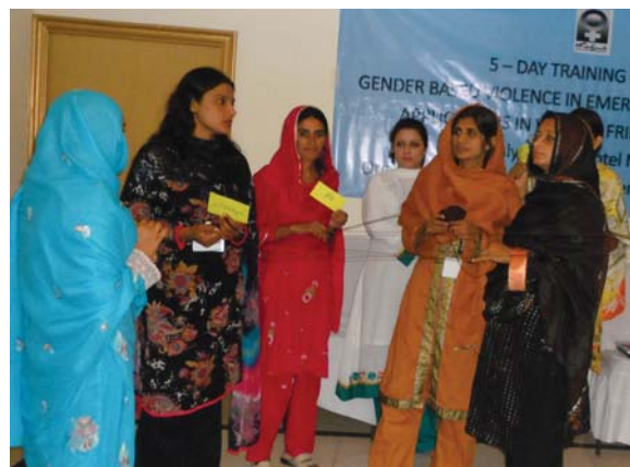
An exercise on the need for multi-sectoral coordination

The WFS was to serve as a hub for community awareness as well as a referral point for survivors of GBV. The multi-sectoral approach for referrals was adopted and referrals partners were inducted based on the quality of services and commitment from them to provide the services agreed upon. The WFS coordinators and the provincial