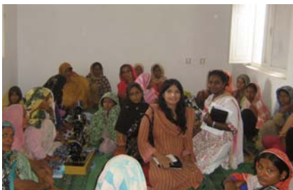
A visit by UNFPA

those seeking help dread repercussions that may ensue if a feudal lord is irked over his authority being threatened. Although the WFS and Shirkat Gah staff members have not come into direct conflict with any of the feudal lords that govern this part of district Shahdadkot, they have often felt frustrated after presenting all options to a survivor who in the end prefers to have a matter settled before a “ vadera ” (local landlord), whom