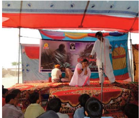
A theatre performance highlighting GBV

A theatre performance based on issues relating to GBV took place at the WFS in Mehmoodkot, Muzaffargarh, in July. The topic of this theatre performance was “ Dhee Da Haq ”, i.e., daughter’s rights. Furthermore, theatre performances were held in each WFS during the 16 Days of Activism Against Gender Violence on violence against women, safe age of marriage, family planning and the need for optimum standards of RH care by community based theatre groups.