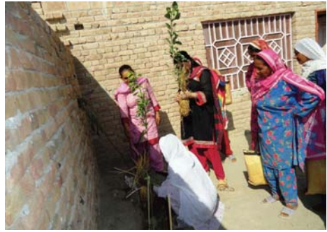
Plantation of tree saplings, Bhakkar

the centre were also displayed. Different stakeholders from various sectors, such as the Executive District Officers (EDOs) of education, doctors, LHVs, forestry department officials were also invited along with community women. The purpose was to shed light upon the different injustices faced by women in rural areas, who make up about 60% of its workforce, and yet are not even give the same pay as men. There was a great turn out at all the WFSs. Women were extremely enthusiastic about learning what this day would mean and actively participated in the activities planned for the day.