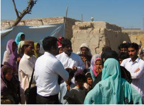
Rapid Needs Assessment being conducted

where a doctor was rarely available. Due to the expense of travel most women do not make the trip to Shahdadkot for checkups, antenatal care, and childbirth etc. unless they feel it is absolutely necessary. Furthermore, the post flood devastation has resulted in destruction of roads and facilities creating issues of accessibility and availability. To make matters worse, the flood nearly destroyed the road joining Qubo Saeed with Shahdadkot city. In one