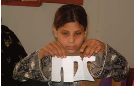
A young girl at the WFS

medical facilities in case of health emergencies.