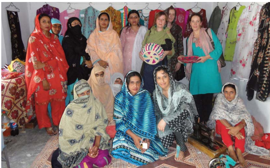
A visit by UNICEF and UNFPA