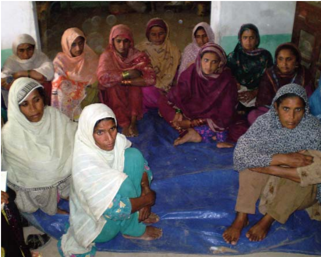
Rapid Needs Assessment and Focus Group Discussion

their daughters outside the locality to attend school.