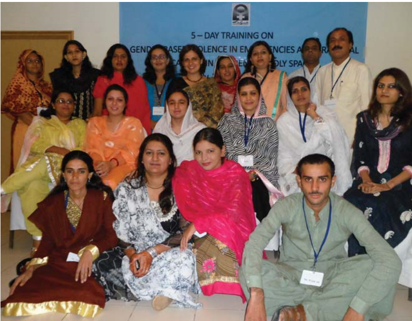
Participants and the facilitator of a GBV training

prevailing Gender-based Violence in the flood affected areas. Having already implemented a successful model of WFSs after the earthquake 2005, Shirkat Gah decided to redesign the model with new applications to address GBV in a focused and organized manner. This was an innovative initiative that would use the WFS forum to reach out to the community to explore the incidence of GBV and engage community elders, religious leaders and