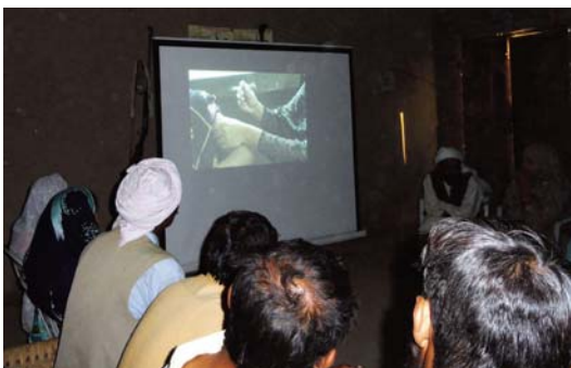
Awareness session with males watching documentary Mumtaz Bach Sakti Thi