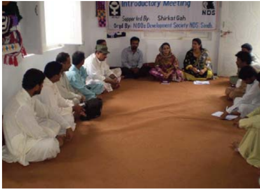
An introductory meeting

When asked if incidences of GBV had increased after the floods the women responded that GBV was so common in the area that they could not say how much it had increased. However, on probing they shared that after the floods many girls were forced to marry against their wishes and many early age marriages were also arranged by family elders in the face of severe socioeconomic crises. They also reported cases of kidnappings of young girls in neighboring districts.