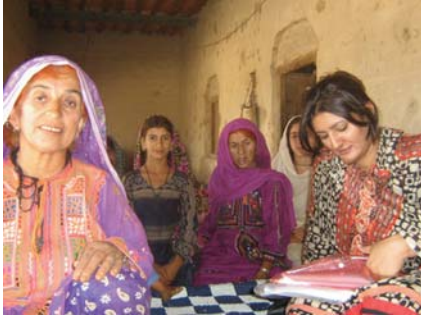
Rapid Needs Assessment and Focus Group Discussion

As in other areas, a severe lack of health services came into sharp focus. There were only two TBAs in the area and women had to travel to Usta Muhammad or Jaffarabad city if they needed to visit a hospital. There was only one girls school in Karim Bux Band and only 2 to 5 girls per village were attending school as most families preferred that they stay home.