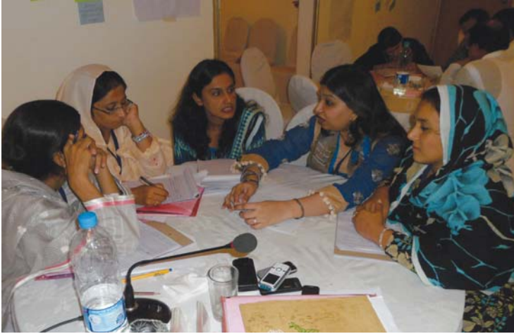
A group activity during the training

focal points personally liaised with local lawyers, health care providers, nearest shelter homes, police stations and other influential members of the community to have a working network in place that would persist beyond the duration of the project. All the referral partners are regularly contacted in