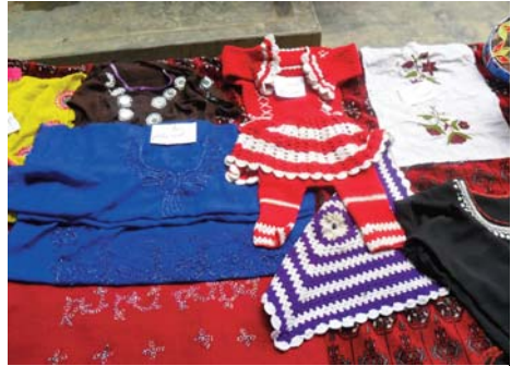
Handicrafts made by the women on display

In the months of May and June, art competitions were held at the WFSs in Punjab and Marghazar where women displayed handicrafts and stitching. To show appreciation of their efforts, gifts were awarded to prize winners.