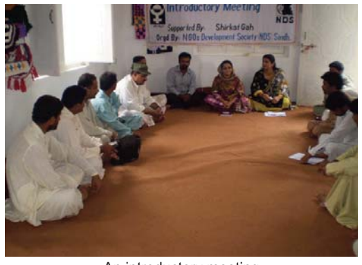
An introductory meeting

When asked if incidences of GBV had increased after the floods the women responded that GBV was so common in the area that they could not say how much it had increased. However, on probing they shared that after the floods many girls were forced to marry against their wishes and many early age marriages were also arranged by family elders in the