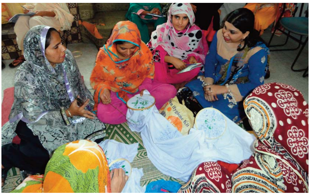
Members of SG & SYCOP share a light moment with women at the Dar ul Aman

complained of a complete absence of medical institutions such as hospitals, clinics or dispensaries, which compelled them to travel to Muzaffargarh city whenever they needed medical attention. Since this was difficult for most women, their health issues were generally neglected and the expense of travel was only borne when it became absolutely necessary. Such challenges to women's mobility meant that childbirth was frequently performed at home and travel undertaken only when complications arose.