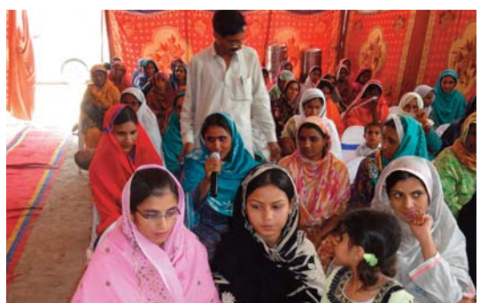
Women participating in a discussion at the inauguration ceremony