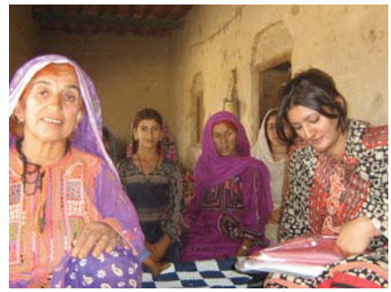
Rapid Needs Assessment and Focus Group Discussion

As in other areas, a severe lack of health services came into sharp focus. There were only two TBAs in the area and women had to travel to Usta Muhammad or Jaffarabad city if they needed to visit a hospital. There was only one girls school in Karim Bux Band and only 2 to 5 girls per village were attending school as most families preferred that they stay home.