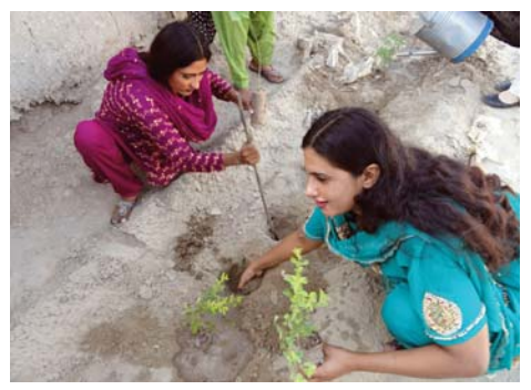
Plantation of tree saplings, Muzaffargarh