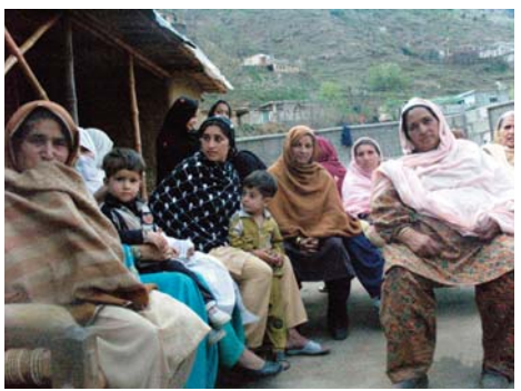
Rapid Needs Assessment and Focus Group Discussion

Marghazar that are not given adequate attention. He points out that there is a dearth of health facilities for women and that even LHVs and dispensaries are few and far between. He also feels that education is not given due importance. "The residents of the area have failed to recognize that