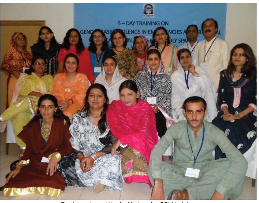
Participants and the facilitator of a GBV training

prevailing Gender-based Violence in the flood affected areas. Having already implemented a successful model of WFSs after the earthquake 2005, Shirkat Gah decided to redesign the model with new applications address GBV in a focused and organized manner. This was an innovative initiative that would use the WFS forum to reach out to the community to explore the incidence of GBV and engage elders. community religious leaders and