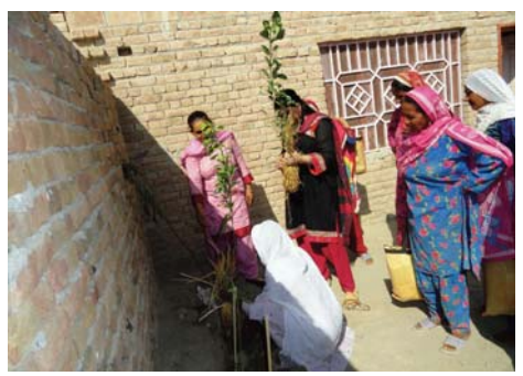
Plantation of tree saplings, Bhakkar

the centre were also displayed. Different stakeholders from various sectors, such as the Executive District Officers (EDOs) of education, doctors, LHVs, forestry department officials were also invited along with community women. The purpose was to shed light upon the different injustices faced by women in rural areas, who make up about 60% of its workforce, and yet are not even give the same pay as men. There was a great turn out at all the WFSs. Women extremely were enthusiastic about learning what this day would mean and actively participated in the activities planned for the day.