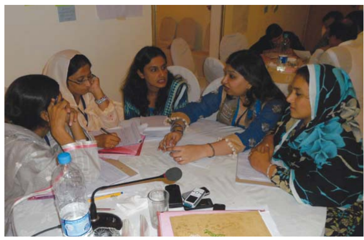
A group activity during the training

focal points personally liaised with local lawyers, health care providers, nearest shelter homes, police stations and other influential members of the community to have a working network in place that would persist beyond the duration of the project. All the referral partners are regularly contacted in