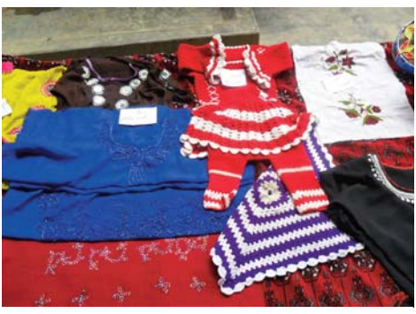
Handicrafts made by the women on display

A theatre performance based on issues relating to GBV took WFS place at the in Mehmoodkot, Muzaffargarh, in July. The topic of this theatre performance was "Dhee Da Haq", i.e., daughter's rights. Furthermore, theatre performances were held in each WFS during the 16 Days of Activism Against Gender Violence on violence against women, safe age of marriage, family