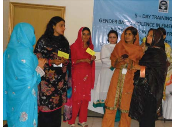
An exercise on the need for multi-sectoral coordination

The WFS was to serve as a hub for community awareness as well as a referral point for survivors of GBV. The multi-sectoral approach for referrals was adopted and referrals partners were inducted based on the quality of services and commitment from them to provide the services agreed upon. The WFS coordinators and the provincial